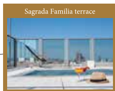
Sagrada Familia terrace