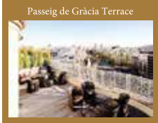
Passeig de Gràcia Terrace