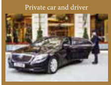
Private car and driver